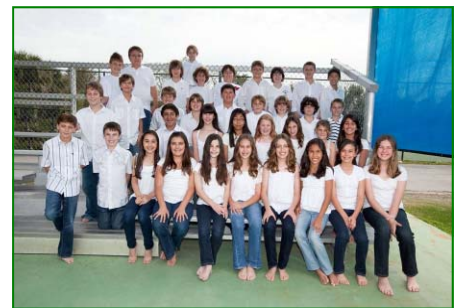
5th grade class

Over the years we have appreciated the involvement of several schools with GVS. It has been heartening to see the students' desire to help less fortunate children around the world. Most recently the 5th grade class of Alexander Montessori School in Miami, Florida decided to raise funds to support GVS' educational efforts in Afghanistan.