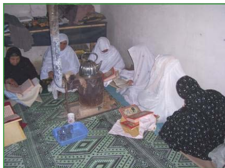
Older girls learning to read and write

A female teacher in Lashkar Gah felt that many women, who were too old to attend school, should be given the opportunity to learn to read and write.